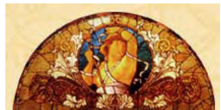
Navy Pier and Auditorium Theater, Chicago, Illinois